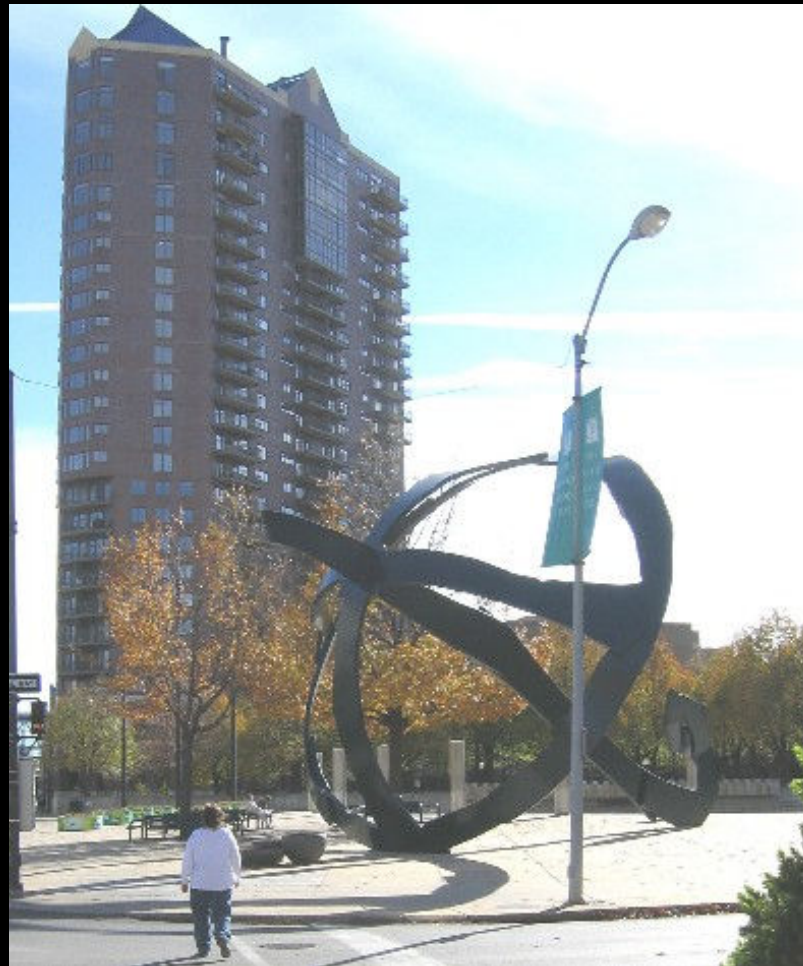
Crusoe Umbrella by Claes Oldenburg, 1979, Cor-Ten steel painted with polyurethane enamel. Public art located in Nollen Plaza, Des Moines, Iowa